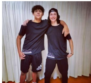
Male Hip Hop / Tap