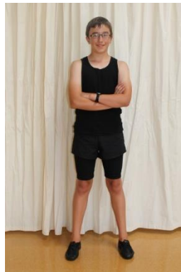
Male Jazz / Contemporary